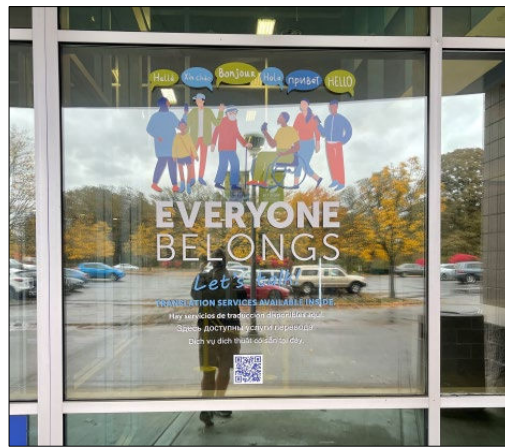
Translation Services Window Wrap