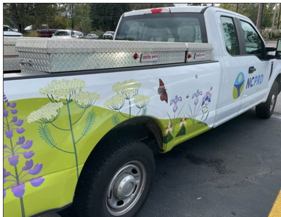
Pollinator-themed Vehicle Wrap