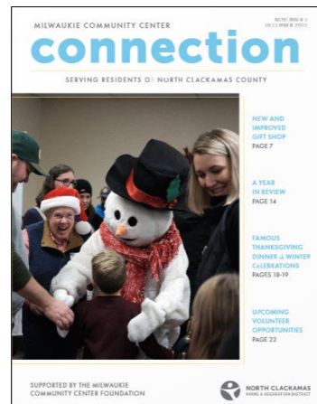
MCC Connection Newsletter