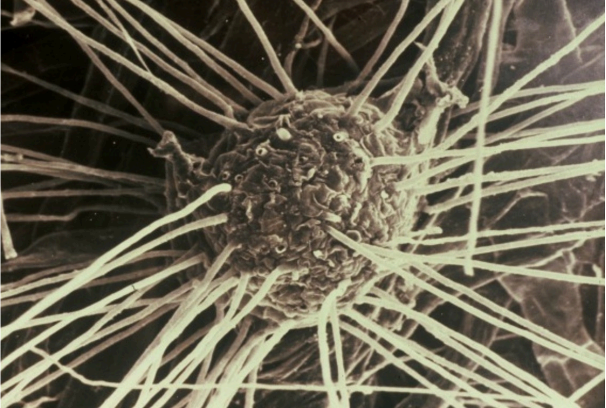
An electron micrograph of a mycorrhiza with radiating mycorrhizal fungal filaments

We hear about many endangered animals in the Amazon and now all around the world. We all know about the chainsaw-wielding workers cutting trees in the rainforest. But we hear relatively little about the destruction of the habitat of kingdoms of life beyond plant and animal -- that of bacteria and fungi. Some microbiologists are now warning us that we must stop the destruction of the human microbiome, and that important species of microorganisms may have already gone extinct, some which might possibly play a key role in our health.