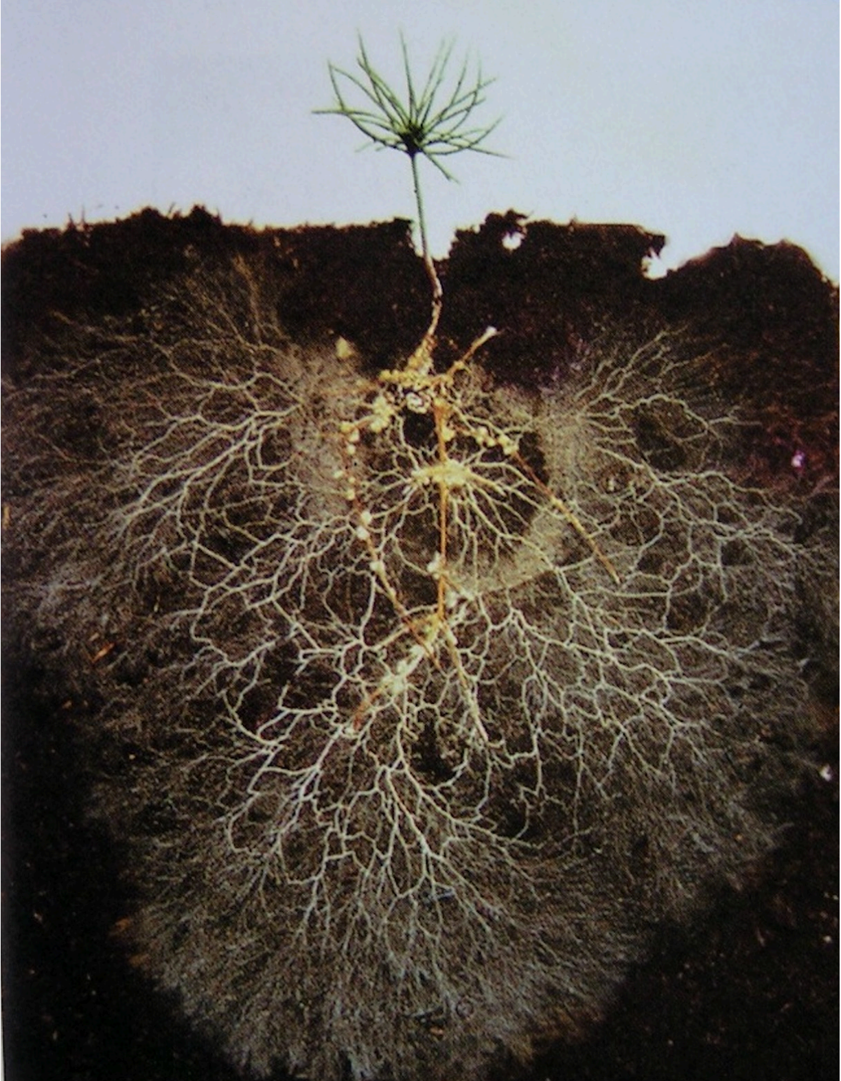
A small pine tree grown in a glass box reveals the level of white, finely branched mycorrhizal threads or "mycelium" that attach to roots and feed the plant. ( David Read )