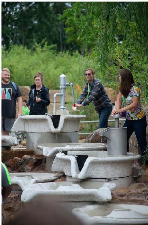
Water Play, Swings & Spinner