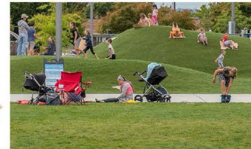
Imaginative Nature Features