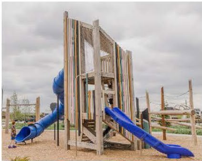
Play Equipment & Nature Play