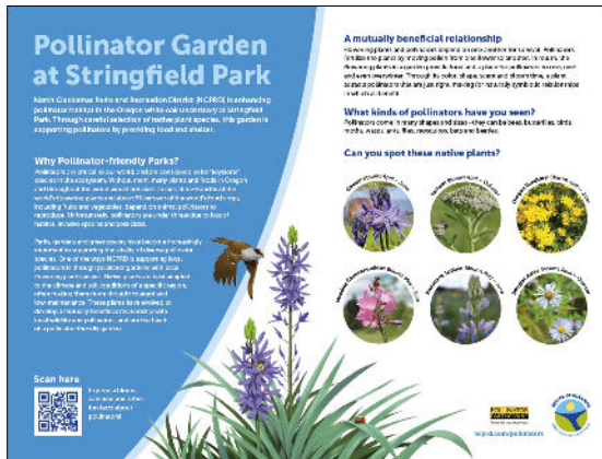
Pollinator Interpretive Sign