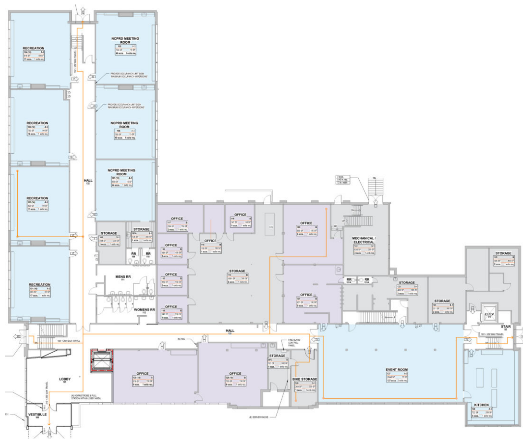
1 st Floor ≈ 22,000 SF